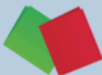
Green and red card