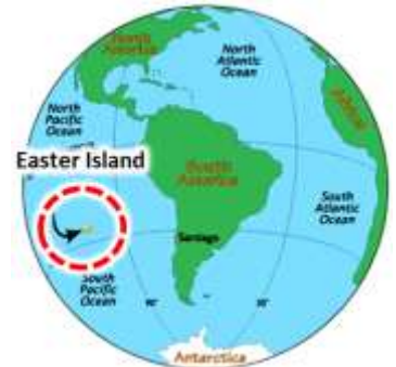
Figure 1 Location of Easter Island on the Globe.

Easter Island is a prime example of what widespread deforestation can do to a society. As the forests are depleted, the quality of life falls, and then order is lost. The example of Easter Island should be enough for us to reconsider our current practices.