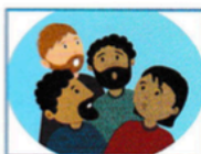
Picture 5: The Ascension