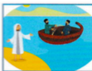
Picture 3: Jesus' Appearance to his Friends at Lake Tiberias