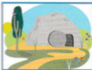
Picture 2: Empty Tomb