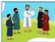
Picture 4: Jesus' Last Words