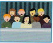
Picture 3: Choir sing 'Alleluia'