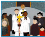
Picture 1: Opening Procession

Show the children the slideshow illustrating what they have learned so far about what happens at Mass. Chat about each of the pictures, focusing on what either the priest, the people, or both are doing in each one: