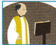
Picture 5: Priests reads the Gospel

Once you have displayed the last picture, recall the words that are said before and after the Gospel reading: